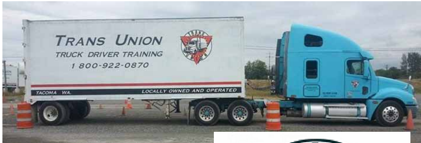
This is the actual logo for a truck drivers' school in Tacoma, Washington (USA) ->