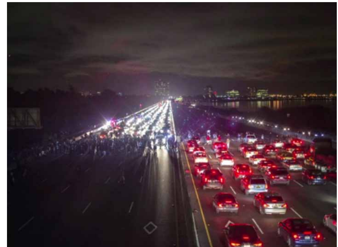
'Every flow can be a wall': Black Lives Matter protesters block a freeway in Berkley, 2014.

As the next phase of the 'logistics revolution' unfolds, in the new spaces, connectivities and flows that are opened up by the strategy of the blockade, those of us that won't submit to logistics' logic must centre those of us, and those parts of us, that can't.