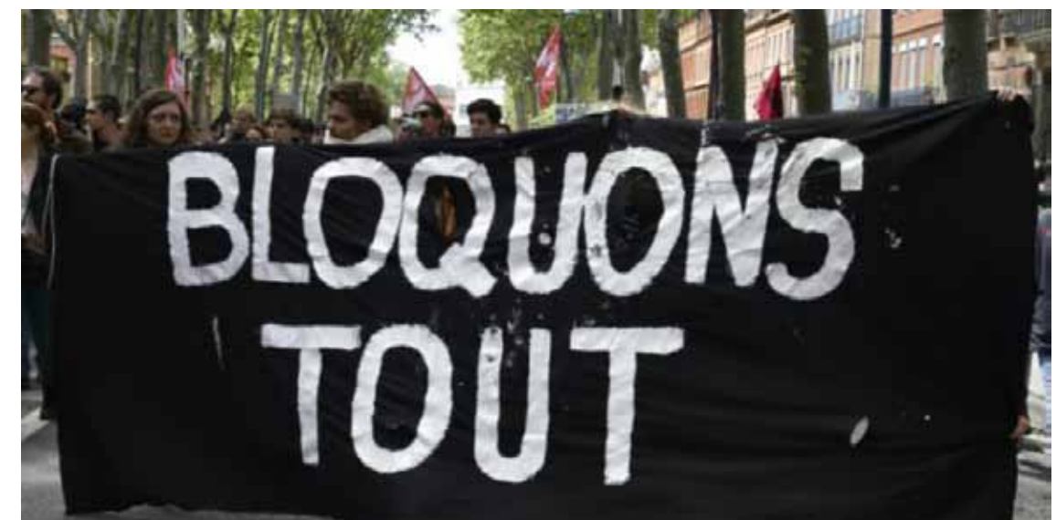
['Let's block everything'], Toulouse, 2016