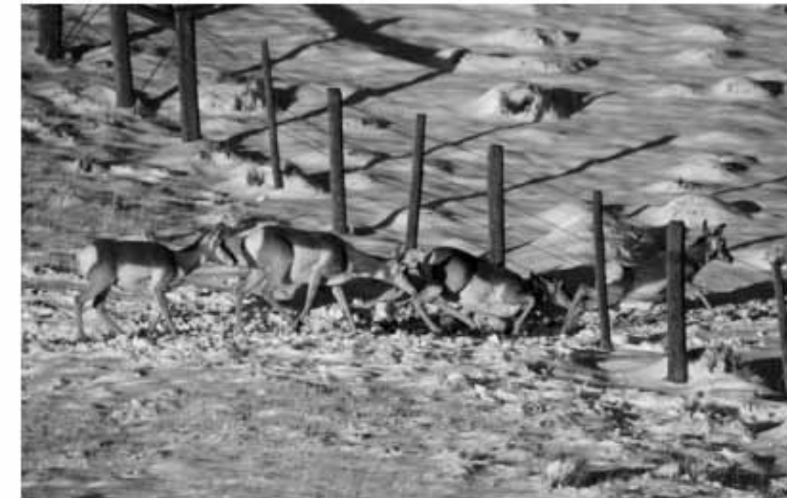
FIGURE 35. Pronghorn antelope migration, 2009.

Great Migrations often hovers on the edge of gruesome: one species grabbing another with outstretched teeth or claws and ripping open flesh or one species hunting then eating the young of another. Yet distinct from similar scenes in the established archive of nature shows is the framing of this violence as a problem of disruption . As the online social gaming companion to the National Geographic series ( MOVE! ) suggests, “With potential risks looming at every turn—from unforgiving terrain to ferocious predators—the decision to keep moving or stop to graze could be one of life or death.”