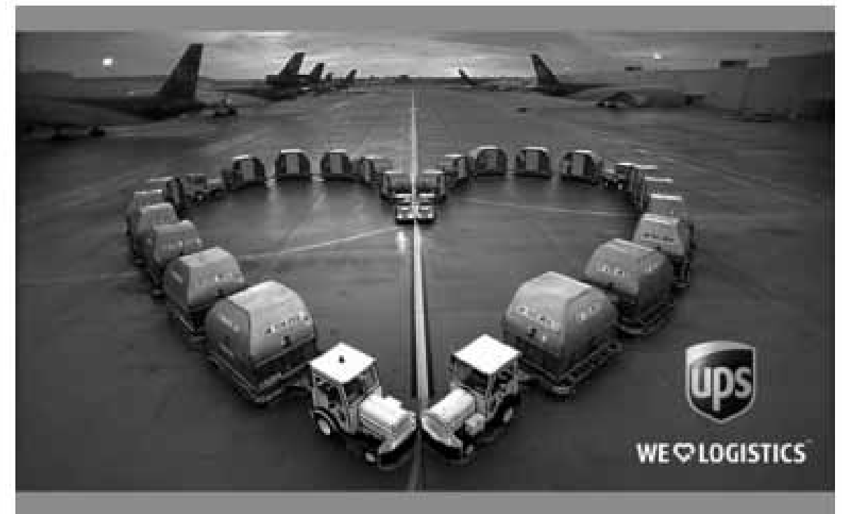
FIGURE 36. UPS advertisement: "We ♥ Logistics."

When it's planes in the sky for a chain of supply That's logistics When the pipes for the line come precisely on time That's logistics A continuous link that is always in sync That's logistics Carbon footprint's reduced, bottom line gets a boost That's logistics With new ways to compete there will be cheers on Wall Street That's logistics When technology knows right where everything goes That's logistics Bells will ring, ring-a-ding Ring-a-ding, ring-a-ding That's logistics There will be no more stress 'cause you called UPS That's logistics